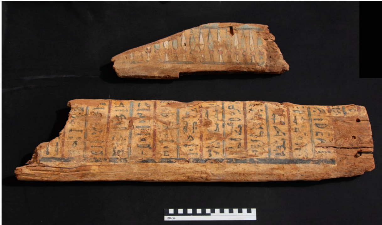
Fig. 4 Board of qrsu coffin of Merit-Neith, Reg. 377b (bottom) and a new match found 2018 (top).