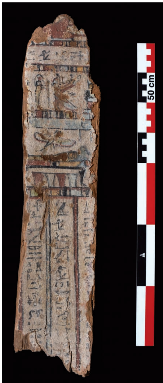
Fig. 3 Fragment of inner anthropoid coffin of Ankh-Hor, Reg. 537.

out due to a very ephemeral painting of low quality – is this due solely to the premature death of the tomb owner, similar to the unfinished state of the underground cult complex? Lack of time, cost savings or simply inadequate execution and low valence – the inner coffin was not a “visible” pres-