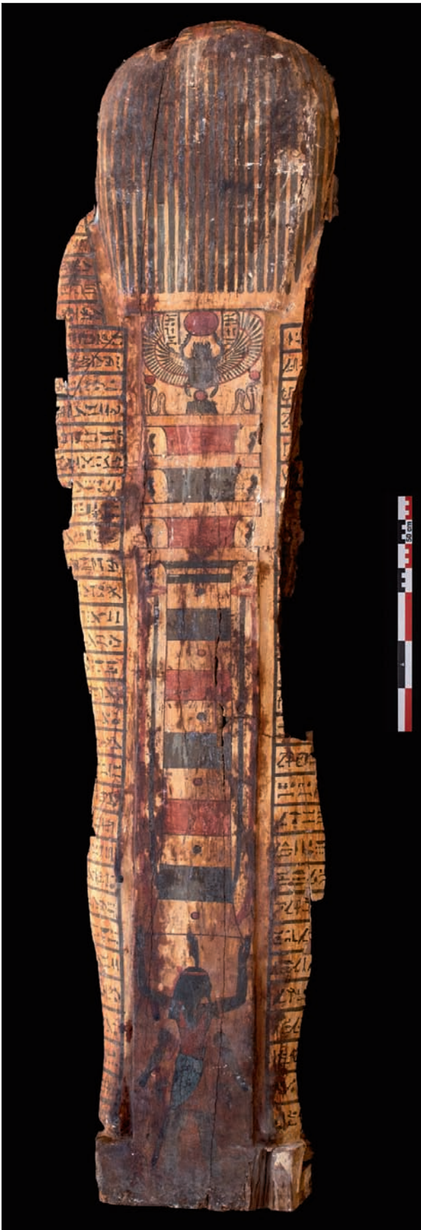
Fig. 6 Back side of anthropoid inner coffin of Iret-Hor-ru, Reg. 590.

The lower part of the associated inner coffin (Reg. 591) of Psametik-men-em-Waset II could be retrieved from shaft 10 again. The once elaborate painting on canvas in blue on white, for which numerous parallels can be found among 26 th Dynasty coffins from Thebes, has suffered greatly due to the robbery and rearrangement. The back of the inner coffin falls into Design 2 after John Taylor, consisting of vertical columns and horizontal lines of texts. 42 All in all, the poor state of preservation of the entire coffin ensemble of Psametik-men-em-Waset II is attributable to repeated deprivation and the reuse and related construction measures. 43