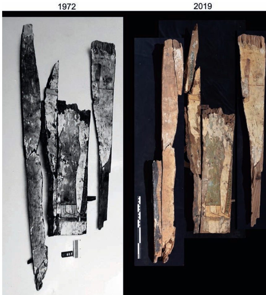
Fig. 2 Comparison of black and white photo and new photographic documentation of inner side of coffin fragments Reg. 657.

the Ankh-Hor Project. The large-scale conservation program will be continued in the upcoming seasons.