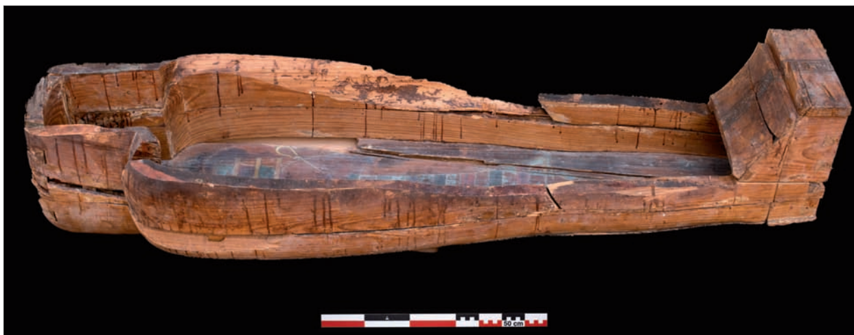
Fig. 10 Inner anthropoid coffin of Aset-em-Akhbit, Reg. 613.

t3.wj ) 50 and his family. Only few fragments from the actual burial of Pa-di-Amun-neb-nesut-tawy I have survived. Reg. 607 is his inner (Fig. 8) and Reg. 680 (Fig. 9) his outer anthropoid coffin. The inner anthropoid coffins of some family members are much better preserved. Reg. 613 and Reg. 614 fall into the same type as Reg. 607 and are polished natural wood coffins with carved decoration datable to the 30 th Dynasty and the early Ptolemaic era. The remains of a Book of the Dead papyrus inside the coffin for Reg. 614 are remarkable. 51 Reg. 613 (Fig. 10), belonging to a lady with the name Aset-em-Akhbit, 52 which was completely cleaned and consolidated in 2019, is of interest because fragments of the lid of its outer anthropoid coffin were also found (Reg. 869, Fig. 11). Unfortunately, this coffin is very fragmented and only a central part of the lid has survived. The outer side of the lid of Reg. 869 shows common scenes known from Late Period coffins and a design with a large flower collar, a depiction of the goddess Nut on the breast and the bier scene with the mummy on the bed. The inner side of the lid is decorated with female and male figures representing the hours of day and night on a light blue background. 53 All in all, the coffins datable to the 30 th Dynasty from TT 414 are important links between the coffin ensembles from the 26 th Dynasty and