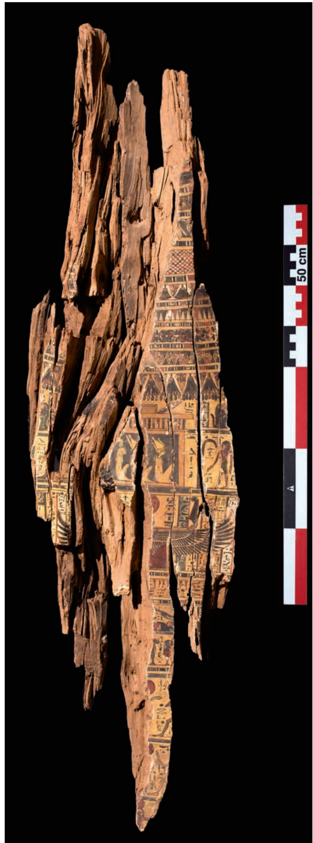
Fig. 11 Fragments of lid of outer anthropoid coffin of Aset-em-Akhbit, Reg. 869.