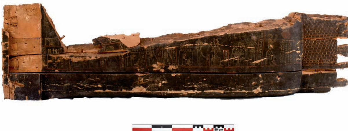
Fig. 13 Outer anthropoid coffin of Tut, Reg. 510.