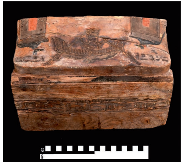
Fig. 8 Foot part of inner coffin of Pa-di-Amun-neb-nesut-tawy I, Reg. 607.