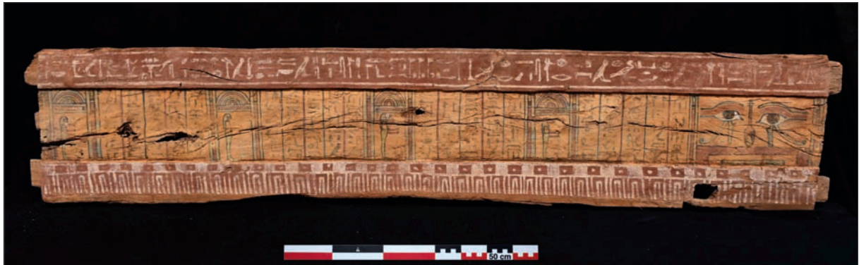
Fig. 5 Board of qrsu coffin of Psametk-men-em-Waset II, Reg. 595.

tions of the solar barque. 37 It belonged to Her-Aset, possibly a sister-in-law of Ankh-Hor. 38