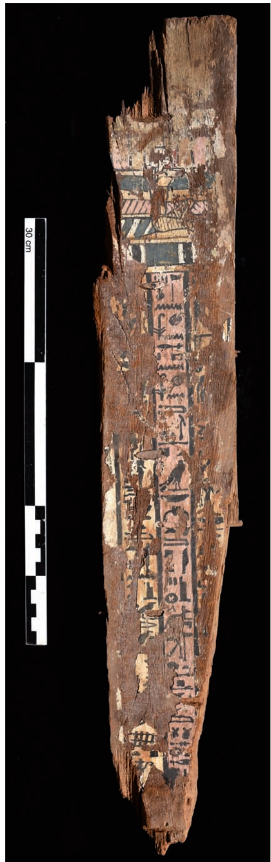
Fig. 14 Fragment of lid of inner anthropoid coffin of Ta-Khonsu, Reg. 800.