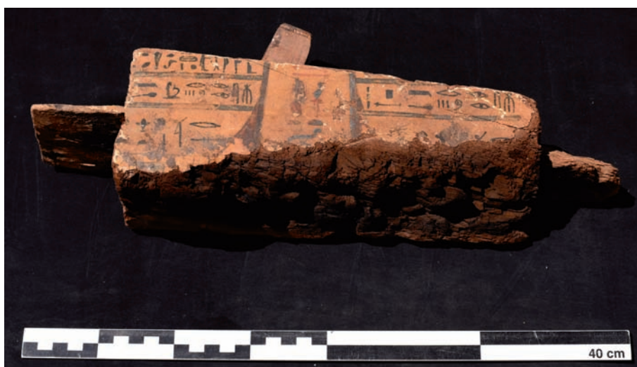
Fig. 12 Remaining fragment of foot board of inner anthropoid coffin of Ta-remetj-Bastet, Reg. 661.

Reg. 510 belonged to a male person with the name Tut of whom no titles are preserved, and his mother is unknown. 66 However, his father Djehuti-irdis was also buried in TT 414, in a very similar outer coffin (Reg. 514) and a colorfully painted inner coffin (Reg. 524). Djehuti-irdis allows the connection of this family with the wider family of Mut-Min. 67 The genealogical data suggest a dating of the death and burial of Tut around 150 BCE.