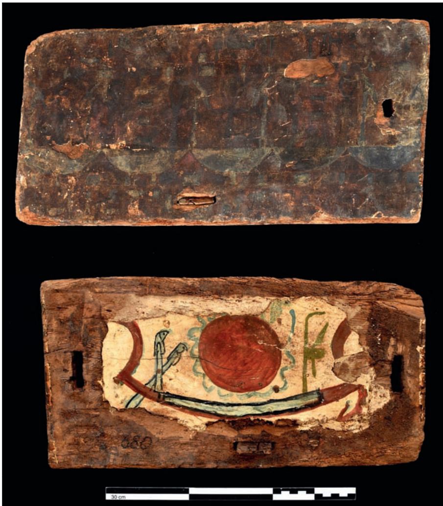
Fig. 9 Foot part of outer anthropoid coffin of Pa-di-Amun-neb-nesut-tawy I, Reg. 680.